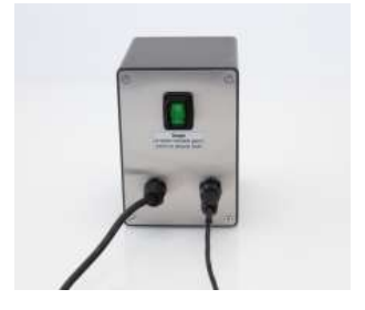
Connect the cable to the external power supply unit and connect the power supply unit with power.